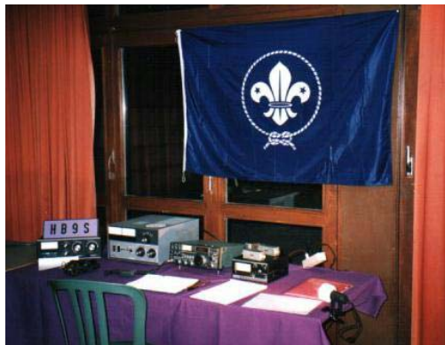
La station principale

Les 19-20-21 octobre 2001, HB9S a participé au 44 e JOTA depuis le centre scout des Pérouses, à Satigny près de Genève (locator JN36AE).