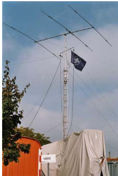
Yves, HB9AOF, station manager 28 october 2004

One scout group called us on HF and was referring to our contact "a few minutes ago". Nobody in Collex was aware of a previous discussion, even looking in the log book, they were not listed. We spent a few minutes to understand they had first contact with the HF station located in the WSB building, have been interrupted, and were re-calling (the other) HB9S