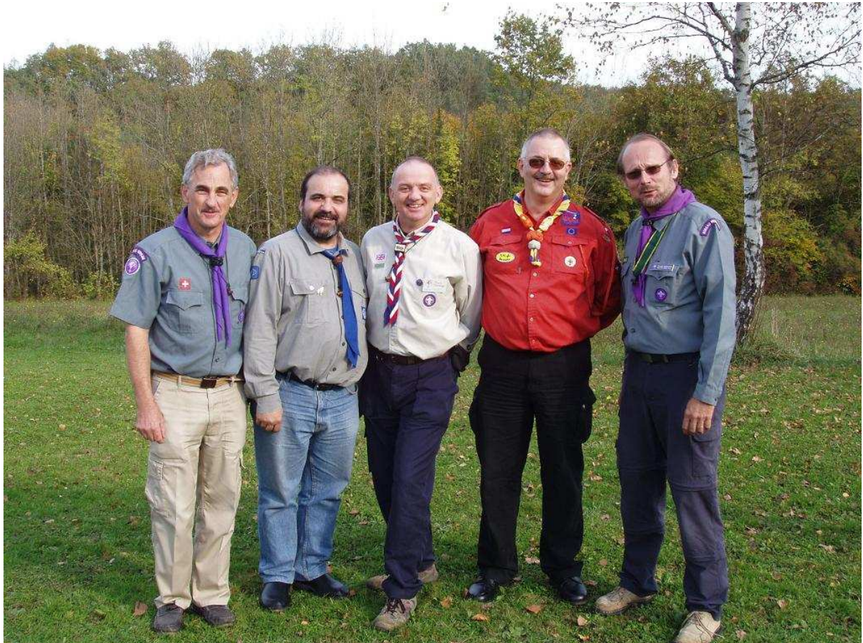
HB9AOF DL9BCP M0AEU PA5UL PA3BAR