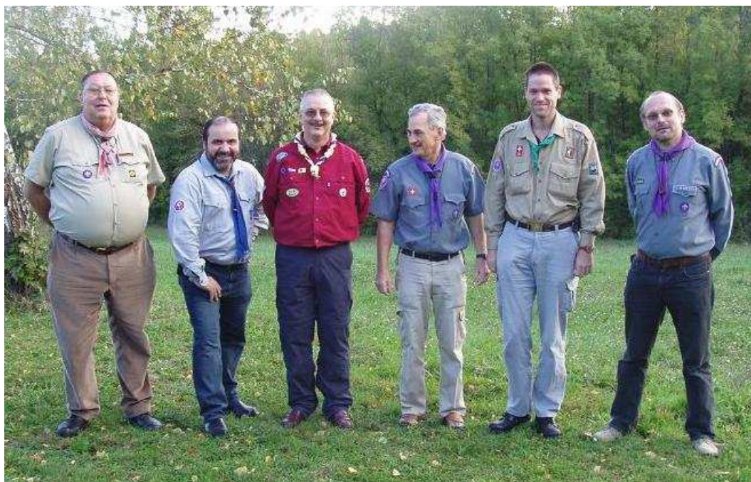
DC4NA DL9BCP PA5UL HB9AOF HB9DTX PA3BAR