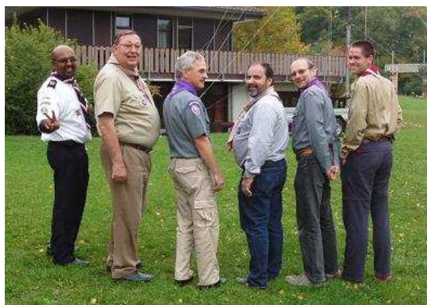
The team "via long pass"