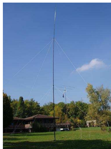
80m vertical and beam in the back