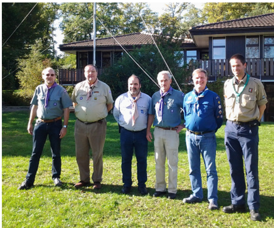
PA3BAR DC4NA DL9BCP HB9AOF OH7GIG HB9DTX