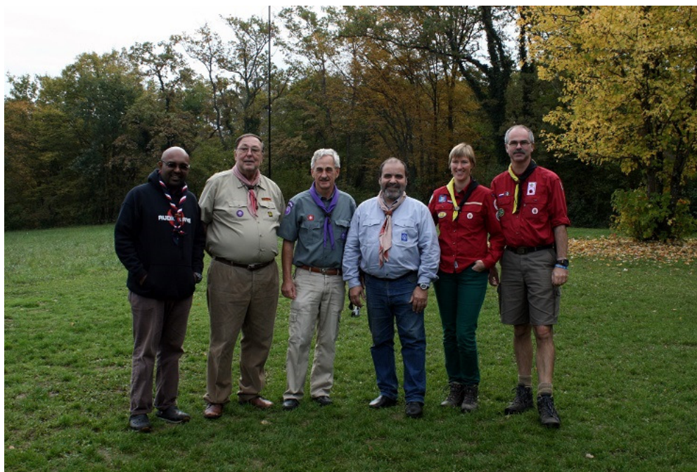
9W2PD DC4NA HB9AOF DL9BCP PD1EHO PA3EFR